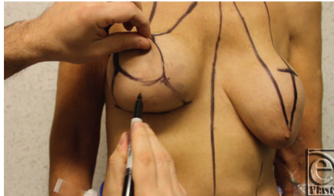
Figure 2. The width between the vertical skin incisions (and therefore the width of the dermal portion of the inferior dermaglandular pedicle) was determined by the amount of skin that could be excised to allow closure without tension both horizontally and vertically. Although this is checked preoperatively by pinch-test, it is safely confirmed and determined intraoperatively after breast implant removal. The height of the flap extends from the inframammary crease inferiorly to the superior medial pedicle superiorly. (Tip of the marker shows the inferior dermaglandular flap.)

regardless of location of breast implant, that is, subglandular versus submuscular implant. A dissection plane is developed first inferiorly staying close to the capsular tissue around the implant. The dissection is then continued circumferentially leaving the implant in place, if possible. This facilitates the dissection and removal of implant as well as capsular tissue en bloc. In addition, it reduces the risk of contamination of the operative site from the implant pocket. In case of subglandular implants, it is usually relatively easy to remove the posterior capsule. However, if the posterior capsule cannot be totally excised, scoring of the posterior capsule is performed to facilitate tissue adherence.