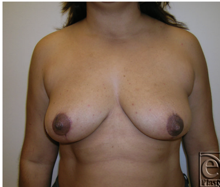
Figure 9. Postoperative frontal view of patient 1 at 12 months after undergoing capsulectomy, breast implant removal, and dual pedicle mastopexy technique.

estimated the volume of the inferior pedicle by the following formula: volume = width (cm) × height (cm) × length (cm). By using the formula: (average volume of the inferior dermaglandular pedicle = 210 cm 3 )/(average volume of the breast implant = 320 cm 3 × 100 = 65%), we calculated that on average, 65.0% of breast implant volume was replaced. There was 1-cup reduction in brassiere size in 21 patients, and the cup size remained the same in 5 patients. Sternal notch to nipple distance ranged between 19 and 22 cm with an average decrease of 6.5 cm. There were no complications related to the NAC. Two patients underwent exploration and hematoma evacuation of the left breast in the early postoperative period. One patient suffered from a superficial wound at the T-junction, which healed with local wound care in 4 weeks. In another patient, hypertrophic scars have formed along the incisions, which were treated with silastic sheet with good response in the long term. Mean follow-up was 14.5 months. Postoperative pain scores were no pain or mild pain in 26 patients who initially in the preoperative evaluation reported having mild pain (11), moderate pain (12), and severe pain (3). Overall patient satisfaction score were 3 (neutral) in 1 patient, 4 (satisfied) in 12 patients, and 5 (very satisfied) in 13 patients.