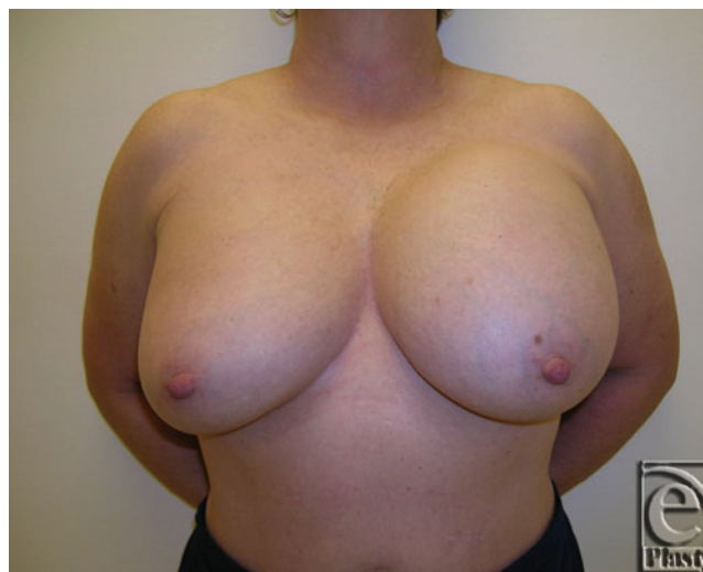
Figure 11. Preoperative frontal view of patient 2 (left breast Baker grade IV) with submuscular implant.