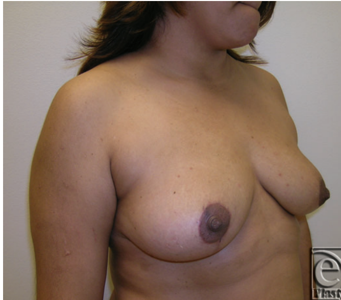
Figure 10. Postoperative right oblique view of patient 1 at 12 months.

removal. In addition, medial and lateral breast pillars were used along with superiorly based NAC to obtain a breast shape with narrower base and more appropriately positioned NAC. In addition, the optimal approximation of medial and lateral pillars helps reduce the potential dead space particularly in the case of relatively larger-size pocket and smaller inferior pedicle.