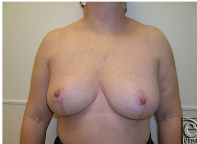
Figure 13. Postoperative frontal view of patient 2 at 14 months after undergoing capsulectomy, breast implant removal, and dual pedicle mastopexy technique.

From technical standpoint, it is critically important to differentiate between subglandular and submuscular implants for an optimal outcome when utilizing this technique. This requires both preoperative assessment and intraoperative awareness and vigilance. During dissection of the implant pocket superiorly, staying close to the overlying capsule allows differentiation between submuscular and subglandular pocket and avoids inadvertent injury to the pectoralis major muscle.