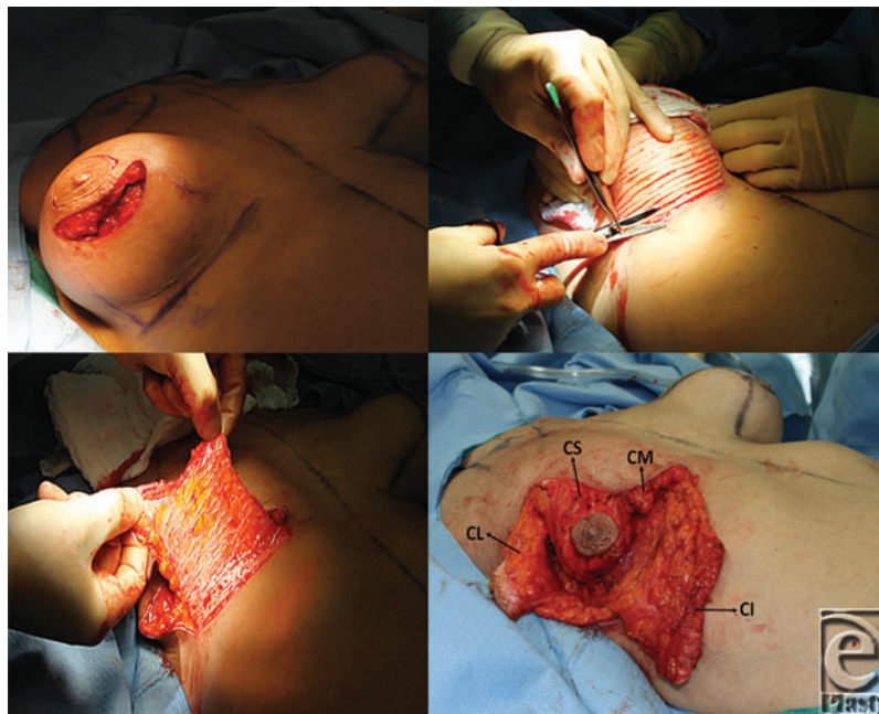
Figure 3. (Left above): A skin incision along the inferior aspect of the superomedial pedicle is made to perform capsulectomy and to remove breast implant. (Right above): Next, the inferior dermaglandular pedicle is de-epithelialized. (Left below): The inferior pedicle. (Right below): All components are separated after capsulectomy and subglandular implant removal (CI: Component I, inferior dermaglandular pedicle, CM: Component M, medial breast pillar, CL: Component L, lateral breast pillar, and CS: Component S, superomedial pedicle NAC).

The dissection of the superior pedicle NAC is the last step. The superior medial pedicle is selected when nipple-areolar elevation is restricted and superior pedicle is not suitable because of firm, dense breast parenchyma, or the NAC needs to be moved a greater distance upward than the superior pedicle permits (Figs 3 and 4). In case of previous submuscular implants, an adequate pocket should be dissected under the superior pedicle and over the pectoralis muscle to accommodate the inferior pedicle.