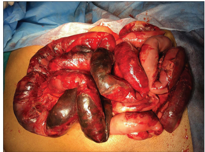
Figure 1: Photograph 1 showing ischemic and gangrenous bowel

AMI is an emergency that necessitates urgent intervention. Outcomes worsen with delay in the diagnosis. Patients generally present with acute pain abdomen, nausea, and vomiting. In our study, also patients presented with similar complaints. Most of them had prodromal warning signs such as intermittent postprandial abdominal discomfort. Most patients neglected these signs and did not seek medical advice. Some were treated as gastritis in smaller, peripheral centers. At the time of presentation, patients had pain abdomen which can mimic pancreatitis, diverticulitis, small bowel obstruction, etc. However, in patients of mesenteric ischemia, patients rapidly deteriorate and pain is out of proportion to symptoms initially. There may be an intermittent decrease in pain due to gangrene, the pain then again increases due to peritonitis. Some patients also complain of bloody diarrhea, which drives the diagnosis more toward mesenteric ischemia in a patient of acute abdomen. In general, SMA embolism or thrombosis