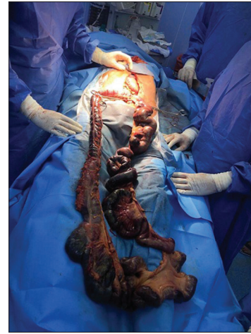
Figure 3: Photograph 3 showing gangrenous bowel

In our study, abdominal USG was done in all patients because it is noninvasive and easily available. Although it was not gold standard, it could suggest gangrenous bowel, which is an indication of emergency surgery. In our study, ultrasound abdomen showed several features such as akinesis of bowel loop (impression given as