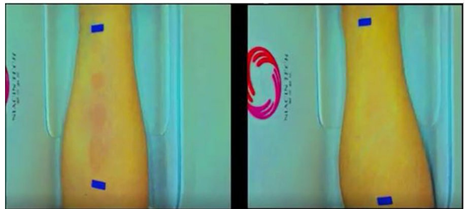
A normal response

Adopting artificial intelligence (AI) technologies for image recognition, we developed a more dependable and accessible diagnostic system based on the niacin skin test that can be used for first-episode schizophrenia (FES) screening. To implement our screening algorithm, we designed a portable device with data collection and processing features for FES screening that detects and evaluates the subject's degree of skin-flushing response to niacin.