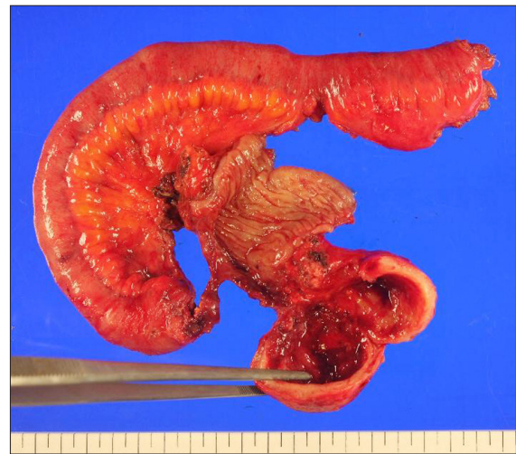
Fig. 4. Resected specimen by laparoscopic segmental resection. Well demarcated round tan-colored firm cystic mass, measuring 6.0 cm × 4.0 cm, protruded from the serosal area.