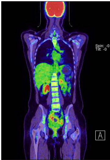
Fig. 2. Positron emission tomography-computed tomography shows malignant tumor in pelvic cavity abutting small bowel and rectum.

Adenocarcinomas are extremely rare. A Pubmed search was performed for all articles with the following words in the title, abstract, or keywords: "Meckel's diverticulum", "adenocarcinoma". Since 1992, 30 people with adenocarcinoma were reported with nine people having been additionally reported so far. In the Surveillance,