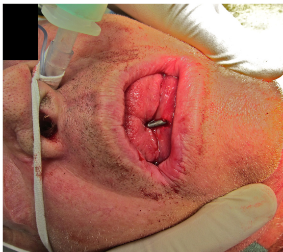
Figure 1 High-velocity nail gun injury that entered through the submental triangle penetrating through the floor of the mouth, tongue, dentures and hard palate, severely limiting mandibular excursion.

area under his chin, pinning his mouth closed. The nails within the thorax could not be confidently located on chest X-ray; however, transthoracic echocardiography suggested a nail had possibly penetrated into the right ventricle. There was no associated pericardial effusion. In light of the potential for rapid deterioration, the patient was immediately transferred to the operating theatre where preparations for an exploratory midline sternotomy and thoracotomy were made.