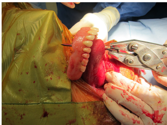
Figure 3 Removal of the nail from the mouth using surgical pliers. The nail was withdrawn through the hard palate, upper denture and tongue.

bypass in a patient with iatrogenically limited mouth opening are challenging. Our patient, who remained cooperative and haemodynamically stable, had a three-inch nail pinning his mouth shut, preventing conventional intubation via the orotracheal route. The potential for rapid haemodynamic deterioration due to the intrathoracic penetrating injury required urgent surgical exploration. The uncertainty in the location of the intrathoracic nails meant the exact nature of the surgical repair was not defined and provision for lung separation needed to be planned for. In this case, the chest X-ray failed to allow an adequate appreciation of the nail within the thorax. This occurred because the nail was imaged in short axis resulting in its appearance as a dot, which rendered it difficult to see. There was also a loss of the characteristic nail shape, which would have facilitated detection. A lateral chest X-ray would have been useful in this scenario but this, unfortunately, had not been ordered. Although transthoracic echocardiography suggested the nail had penetrated the right ventricle, the exact location of the nail was not visualized.