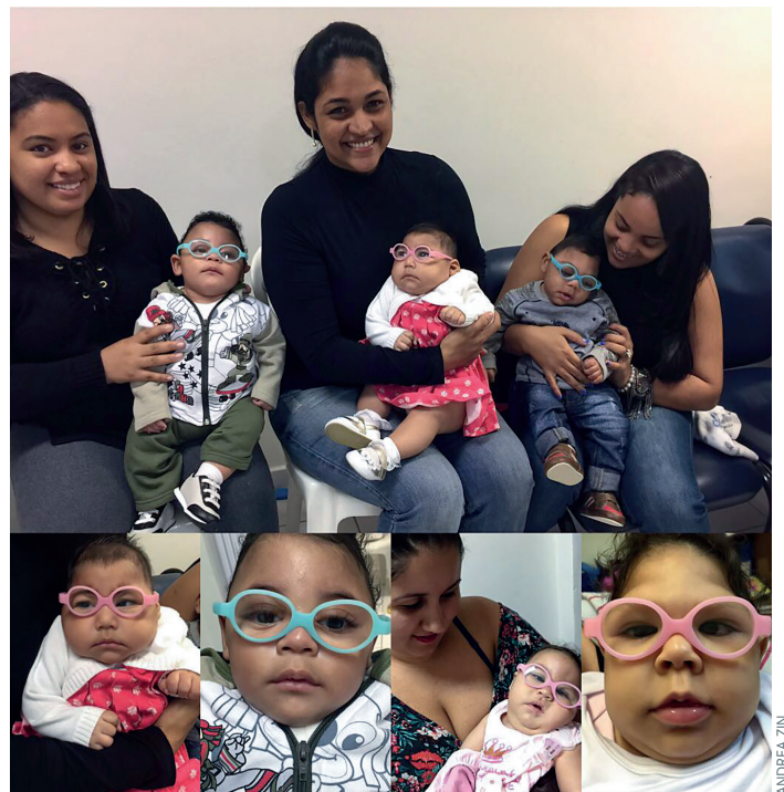
Figure 3 Children with congenital Zika syndrome wear magnifying glasses