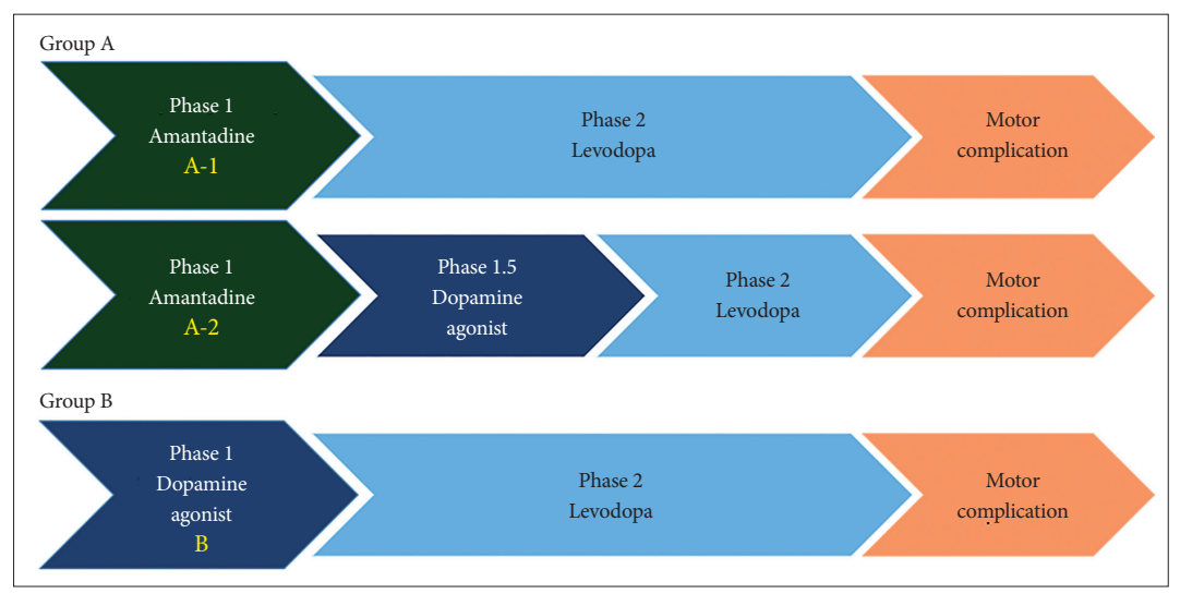
Figure 1. Study protocol.

opment of LID, including both peak-dose dyskinesia and diphasic dyskinesia. The secondary outcomes were as follows: 1) adverse events and adherence to each drug, 2) initial non-motor symptoms (NMS) as a predictor for the later development of dyskinesia, and 3) clinical characteristics and final doses of medication related to dyskinesia.