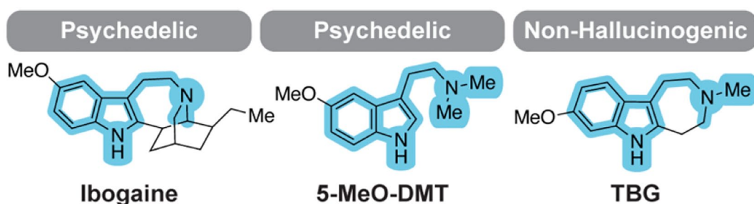
Figure 2. Structural similarities of ibogaine, 5-MeO-DMT, and TBG. The common N,N -dimethyltryptamine core of all 3 molecules is highlighted.

bottom-up mesolimbic circuits, while therapeutic memories involve top-down corticolimbic circuits. Thus, treatments that enhance activity in corticolimbic circuits are potentially useful for treating addiction and related disorders involving cortical atrophy such as PTSD and depression.