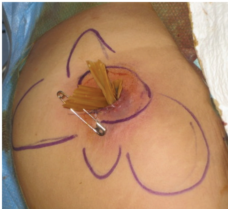
FIGURE 2: Intraoperative view after debridement of the gluteal collection and placement of drains in undermined areas (drawn in blue).

Mundipharma Medical Company) twice a day for four days. Drains were progressively removed and daily dressings were replaced by intermittent negative-pressure wound-therapy at postoperative day eight for four weeks (Figure 2). Six weeks after surgical debridement, the wound was healed.