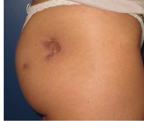
FIGURE 3: At six months' follow-up, a hyperpigmented scar of a three-centimeter diameter was present in the middle of a depressed area of about seven centimetres in the right gluteal region. The scar is not hidden in a conventional swimming suit.

Ziehl-stain performed on the puncture of the right gluteal abscess revealed the presence of the same strain found in the breast analysis of Mycobacterium abscessus subsp. massiliense . Formal antibiotic susceptibility testing of the NTM strain showed again sensibility to amikacin and clarithromycin as well as intermediate sensibility to linezolid and cefoxitin; furthermore, it showed resistance to tobramycin, moxifloxacin, ciprofloxacin, imipenem, and doxycycline. Tigecycline and amikacin were stopped after 12 days on request of the patient due to nausea and linezolid was stopped after 30 days for cutaneous rash and drug-induced hepatitis. Monotherapy with clarithromycin was maintained for additional 17 days. It was then enlarged with moxifloxacin for a small contralateral gluteal collection found on the control-MRI along with