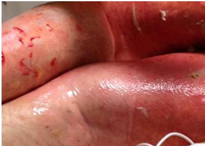
Fig. 1. DRESS exanthema.