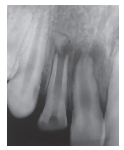
Fig. 2: Intraoral periapical radiograph showing class III fracture with displaced apex and periapical radiolucency

Corresponding Author: Aman Moda, Moda Nursing Home Jhajjar Road, Rohtak, Haryana, India, Phone: +919355267909 e-mail: dramanmoda@gmail.com