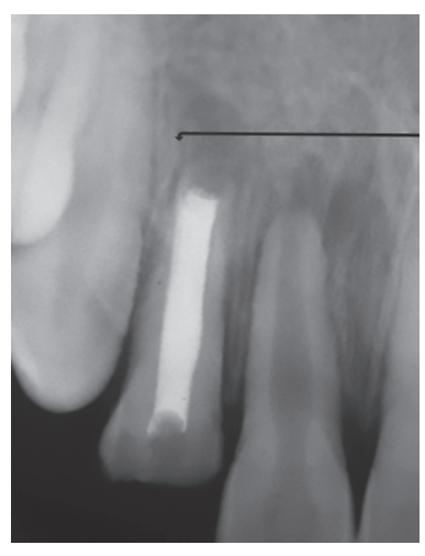
Fig. 5: Intraoral periapical radiograph with an arrow showing retrograde filling done using zirconomer-reinforced glass ionomer cement and removal of root apex

gave the history of putting the sticks in the canal since the fracture to counter irritation. Retrieval of that stick was tried using ultrasonic, H-Files, and ProTaper files, but all in vain. So, it was decided to treat it surgically. Labial mucoperiosteal flap was raised and bone cutting was done by surgical bur (Fig. 3). The displaced fractured immature root apex was removed along with the wooden stick (Fig. 4) and the retrograde filling was done using zirconium-reinforced glass ionomer cement (Fig. 5).