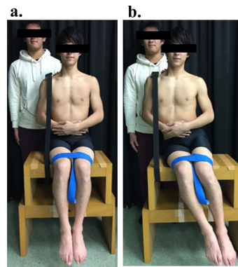
Fig. 2. The length of the belt is decided according to the start position The sensor of the handheld dynamometer is placed on the inner part of the acromioclavicular joint (a). The position of the belt is moved by 10 cm toward the side (b).

Generally, the trunk function was evaluated subjectively. Few reports evaluated trunk function quantitatively, such as measurement of muscle thickness of the abdomen using ultrasonography 12) , electromyography 13) , assessment of core strength endurance of ventral and dorsal trunk muscle chains 14) , and isokinetic and isometric trunk extensor and flexor tests on dynamometer 15) . These are considered to be valid in evaluating trunk muscle function. However, trunk function should be evaluated with more physiological conditions, such as an anti-gravity position. Novel objective evaluation method for trunk function (trunk righting test, TRT) was recently established 16) . TRT is considered to be reasonable because the test was performed under loaded sitting position. Therefore, we hypothesized that TRT and motor function of patients with knee OA are correlated and TRT can better evaluate the trunk function of patients with knee OA. The purpose of the present study was to validate the importance of the trunk function with motor function in patients with knee OA and to show the clinical use of TRT.