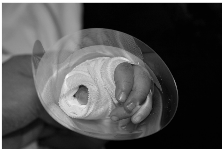
Figure 3 It is imperative to expose tips of all fingers for observation of circulation and most importantly the additional benefit of reassurance to the child that all fingers are still visualized and movable by him.