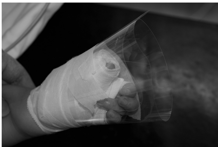
Figure 2 It is then rolled over the ordinary bandage dressing as sushi hand roll, securely held in place at wrist level with 1-inch wide 3M™ Micropore™ medical tape.

A new post-operative dressing method has been devised for paediatric patients after surgery for thumb polydactyly. It not only provides a safe, but also securely comfortable dressing. The indication of sushi hand roll dressing can be extended to other pediatric hand conditions like syndactyly, hypoplastic thumb, congenital trigger thumb, and burns.