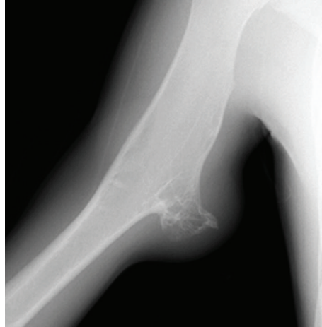
FIGURE 1: Oblique radiograph of the right arm shows soft tissue swelling overlying a broad-based osteochondroma arising from the humerus and directed towards the chest wall.