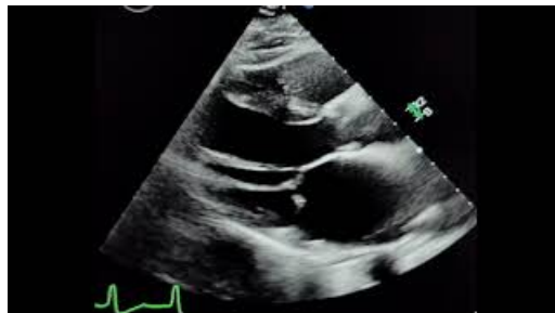
VIDEO 1: Atrial fibrillation with reduced ejection fraction and left atrial dilation

The patient continued to remain in atrial fibrillation, which was rate controlled. The patient was also started on apixaban for anticoagulation. Her subsequent echocardiogram showed new-onset heart failure with a reduced ejection fraction of 35 to 40% and left atrial dilation (Video 1). The patient underwent a thyroid ultrasound which revealed a multinodular goiter with a dominant nodule in the isthmus. Her autoimmune work-up showed a positive thyroid receptor antibody test. Her thyroid-stimulating immunoglobulins were also elevated to 506%. Cardiology deferred direct current cardioversion (DCCV), and the patient was scheduled for an outpatient radioiodine thyroid uptake scan with the possible need of a fine needle aspiration (FNA) biopsy for further evaluation. A follow-up echocardiogram in two months did not show any decline of ejection fraction, and the patient was medically managed for hyperthyroidism and atrial fibrillation with rate control.