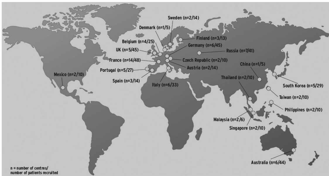
Figure 1 World map showing geographical distribution of participating centres in Upper Limb International Spasticity II (ULIS-II).