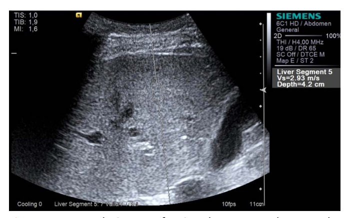
Fig. 1. An example image of point shear wave elastography assessment in the right liver lobe in a 36-year-old woman with pulmonary arterial hypertension. The region of interest was placed at a depth of 4.2 cm from the skin surface, and a shear wave velocity of 2.93 m/s was obtained.