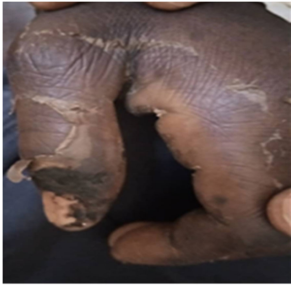
Fig. 3 Image showing pronation stiffness of left upper limb at snake bite point, in a 30-year-old woman presenting with motor deficit, speech disorder, and consciousness disorder