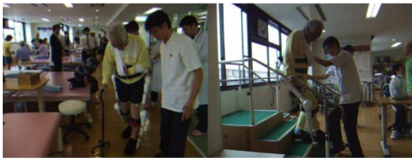
Figure 1 A stroke patient using the hybrid assistive limb (HAL) suit. The left image shows a patient using the HAL suit and walking with a cane, and a physiotherapist pays attention to the patient while noting his fall. In the right image, the patient is being trained to climb down stairs by a physiotherapist.

increase and assist the voluntary motor function of the body and is used to provide walking support for people who require nursing care, including the elderly with muscle weakness and people with impaired motor function [4,5].