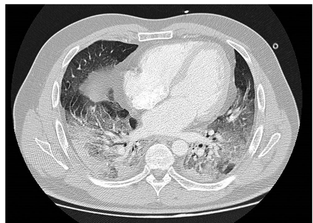
Fig. 3 Chest computed tomography from July 15 showing diffuse bilateral ground-glass opacities with some areas of “crazy-paving” pattern and extensive subpleural consolidation of the lower lobes