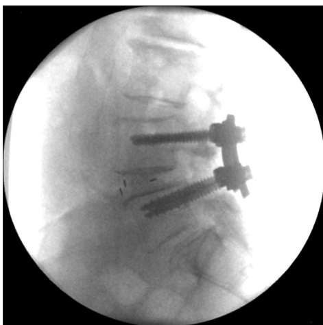
Figure 1: Single instrumented level