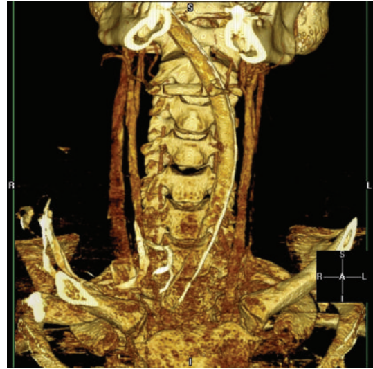
FIGURE 2: Three-dimensional CT scan of neck.

In our case, endotracheal intubation in the field was preferred because the patient was unconscious with an unstable hemodynamic status and obvious risk of losing airway as a result of further edema and an increased pressure to the airway. A good result was achieved with this out-of-hospital