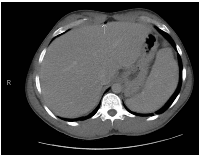
Figure 4. Abdominal and pelvic computed tomography showing punctate focus of free air adjacent to liver (arrow).

An additional risk factor for enteric complications may be the virulence of the C. jejuni isolate. Drug-resistant C. jejuni species are associated with an increased risk for invasive illness and