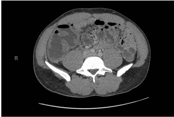
Figure 1. Abdominal and pelvic computed tomography showing distended and thickened fluid-filled loops of distal ileum and colon.

The patient underwent an emergent exploratory laparotomy, which revealed cecal perforation complicated by gross fecal contamination of the abdomen. Peritoneal cultures were obtained, and an ileocolic resection with a side-to-side ileocolonic anastomosis was performed. Pathology demonstrated active enterocolitis with ulceration, patchy mild crypt distortion, transmural colonic perforation, and acute serositis (Figure 3). There was no evidence of chronic mucosal injuries such as granulomas, transmural chronic inflammation, or mural scarring, arguing against an underlying diagnosis of inflammatory bowel disease. Intraoperative cultures grew pan-sensitive Enterococcus faecalis , whereas blood cultures remained negative. He was treated with 8 days of meropenem overlapped with 3 days of gentamicin for empiric treatment of C. jejuni . Antibiotic therapy was extended with an additional 4 days of piperacillin-tazobactam to complete treatment of E. faecalis .