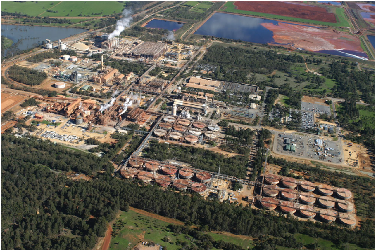
FIGURE 2. Aerial photograph of Pinjarra Refinery in Western Australia.

Heat and humidity are encountered in tropical locations. Although heat stroke has not been reported, heat exhaustion and malaria may occur. Control measures are necessary and have been discussed in detail elsewhere. 4–6