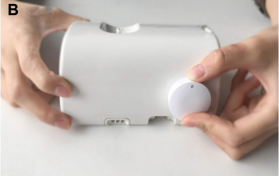
Figure I Photographs of an electronic smart device and nebulizer. Notes: (A) An electronic smart device (red framed) and a nebulizer before assembly. (B) After the 2 devices are assembled.