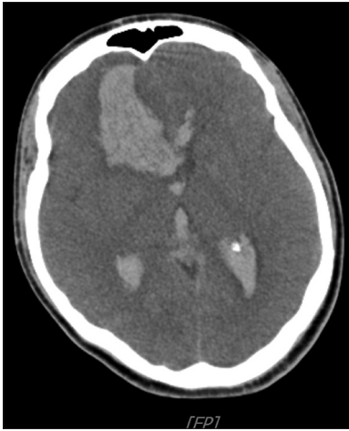
Figure 1: Axial computed tomography image showing right frontal lobar hematoma opening to the ventricular system

of the patient improved gradually within a week, and the several CT scans showed total resolution of the hematoma after 20 days. During the patient's hospital stay, no other complication occurred, and he was discharged with full recovery.