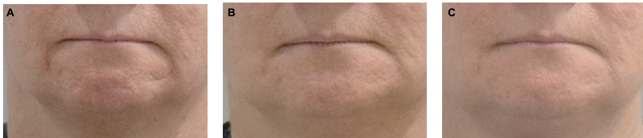
Figure 3 Scar correction with hyaluronic acid dermal filler.

Notes: A 61-year-old patient suffering from grade 2 facial lipoatrophy (Ascher's scale), before ( A and D ) and after the treatment at Week 4 ( B and E ) and Week 24 ( C and F ). A total of 8 mL of the filler was injected into the midface: 6 mL on Day 1 and 2 mL 2 weeks later for a touch-up on the left side.