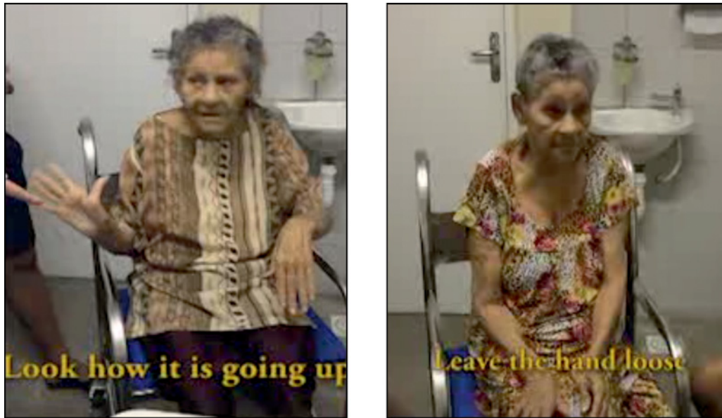
Video 1. Segment 1. Before Amantadine Treatment. Forced, painful, retrograde elevation of the right arm. The patient can be seen constantly holding her right arm with her left hand to prevent the alien movement. The video also details the difficulty that the patient experienced performing simple tasks with her right hand, because the right hand was acting on its own. Segment 2. After Amantadine Treatment. Although significant right arm paresis is evident, forced arm elevation is minimally evident and she can perform simple tasks with her right arm much better. Occasionally one can see that mild to moderate alien hand symptoms persisted. Significant apraxia is also quite evident, i.e. the patient could not clap her hands and tried but could not show how to comb her hair with her hands.