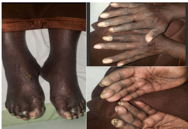
Fig-1. Dermatologic findings.

Our patient presented with acute exacerbation of symptoms of scleroderma-associated interstitial lung disease complicated by cor pulmonale. CT chest has shown ground attenuation, traction bronchiectasis, septal thickening, and honeycombing which are consistent with standard findings of interstitial lung disease in HRCT which is considered the most sensitive and gold standard modality in the diagnosis of SSc-ILD and has the utmost importance in monitoring disease prognosis. Despite established guidelines to use HRCT for SSc-ILD diagnosis only 66% of SSc experts are using it. Lack of clinical experience, lack of adequate knowledge, radiation exposure, imaging cost, and feasibility may be among the factors in its hindrance [2]. Chest x-ray AP view showed characteristic patchy consolidation in the left mid and lower lobe with ill-defined left costophrenic angle and left dome of