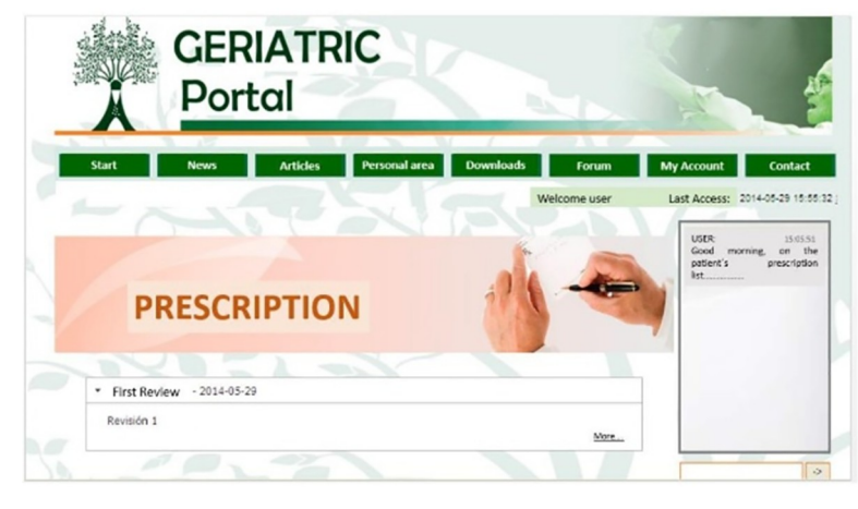
Fig 2. AGAlink screen.

The purpose of this study was to carry out a pilot test to know the important points for the acceptance and use of the AGAlink that would allow its improvement and its implementation on daily practice at the first level of care for the prevention of prescription problems among older adults. Identifying how well physicians adopted the recommendations provided by the portal.