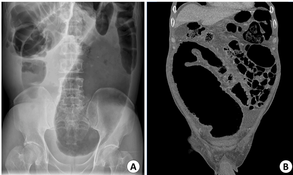
Fig. 1. (A) Abdominal X-ray finding of marked distension of large bowel loops; (B) AP-CT findings of dilated sigmoid colon and rectum (maximum diameter: 12 cm, sigmoid colon).

Dyssynergic defecation is the failure to complete a series of defecation processes. The defecation process occurs completely when the abdominal, rectal, pelvic floor, and anal sphincter muscles effectively coordinate [8,14,15]. One important aspect of childhood development is the acquisition of toileting skills and establishment of continence. The establishment of bowel control usually starts between 21 and 36 months of age, and is completed by the age of four [16]. Thus, dyssynergic defecation is an acquired behavioral problem. The present patient's