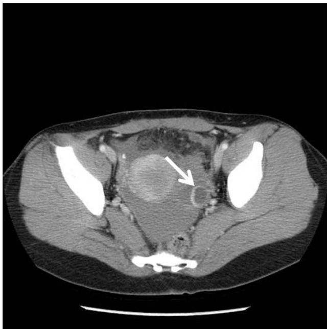
Fig. 1 Fluid collection and left ovary cyst was noted on computed tomography. The size of ovary cyst was 2.0 \times 1.8 cm (arrow).

copy owing to incomplete bowel preparation. The bleeding was controlled by #3-0 Vycryl intracorporeal suture, and the invagination of the diverticulum was performed laparoscopically. The recovery was uneventful, and the patient was discharged on postoperative day 4.