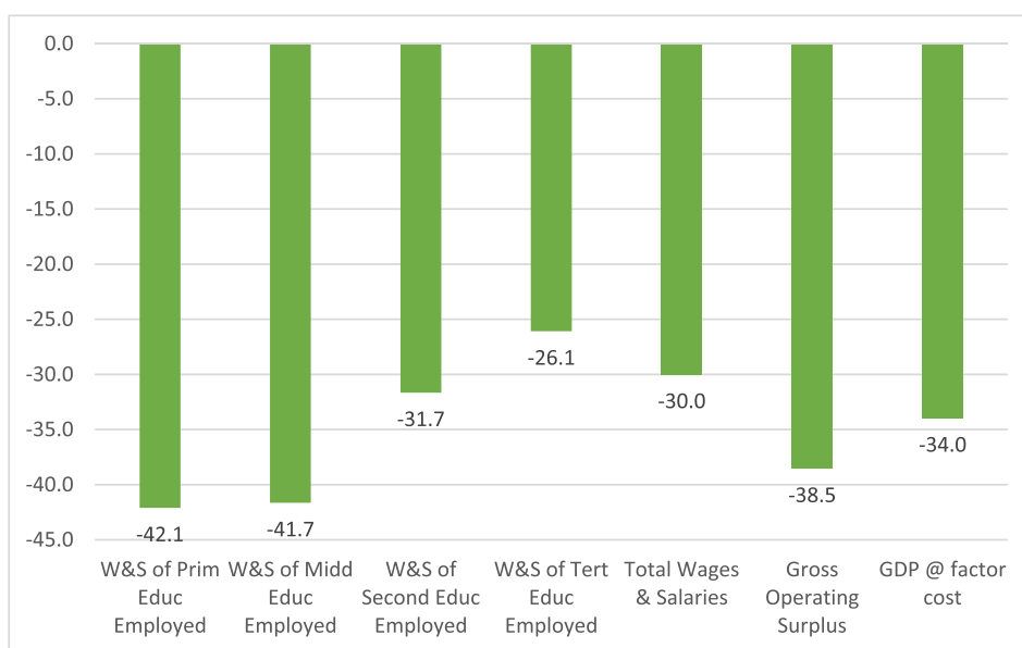
Fig. 1. Impacts on wage earnings and income GDP components, as percentage deviation from their pre-crisis levels.

Combining these effects results in larger negative impacts on richer households. Middle income households rely more than the wealthy on lower educated wage earnings, but they are less cushioned than the poor by government transfers.