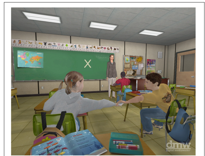
FIGURE 1 | A screenshot from the virtual classroom CPT.

Respondents are instructed to view a series of letters presented on the blackboard and to respond by hitting the spacebar on the keyboard only after observing an "X" preceded by an "A" and to withhold responding in any other condition. The letters were presented at a rate of one every 1350 ms and remained on the screen for 150 ms, with trials lasting 10 min, comprised of 400 stimuli. There were pure auditory distracters (classroom noises), pure visual distracters (paper airplane flying across the visual field), and mixed auditory and visual distracters