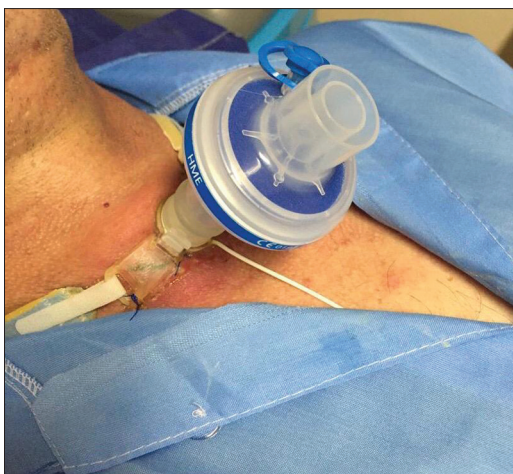
Figure 1: Antimicrobial/antiviral ventilator filter connected to the tracheostomy tube

Mohammad Behgam Shadmehr, Fariba Ghorbani, Mojtaba Mokhber Dezfuli