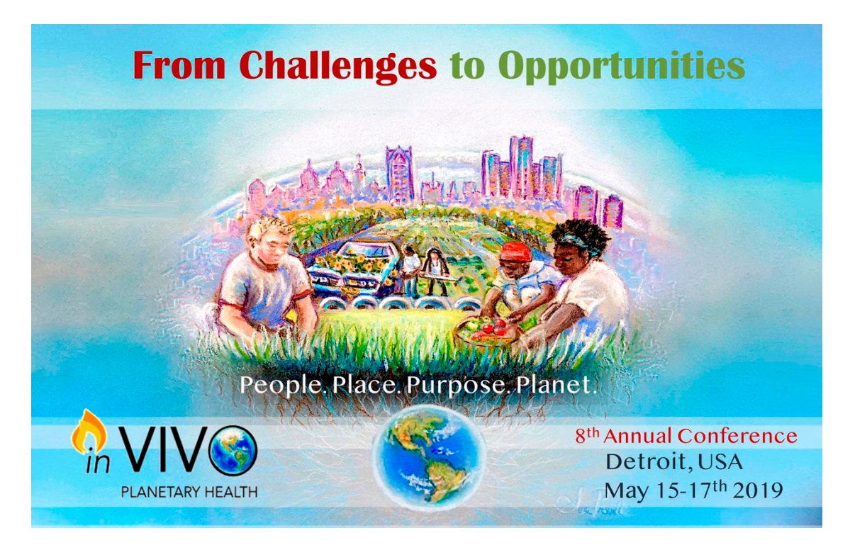
Figure 1. The theme of the 8th annual conference of inVIVO Planetary Health, held in Detroit, Michigan from 15–17 May, 2019 was "From Challenges, to Opportunities".

The 8th annual conference of inVIVO Planetary Health (inVIVO), was held in Detroit, Michigan from 15 to 17 May, 2019. Our theme, "From Challenges, to Opportunities", addressed the complex interdependent ecological challenges of advancing global urbanization and the impact on personal, environmental, economic, and societal health alike (Figure 1). Broadly, we discussed the multi-faceted dimensions of global 'dysbiotic drift' (life in distress) [1] on every level and explored strategies to overcome this.