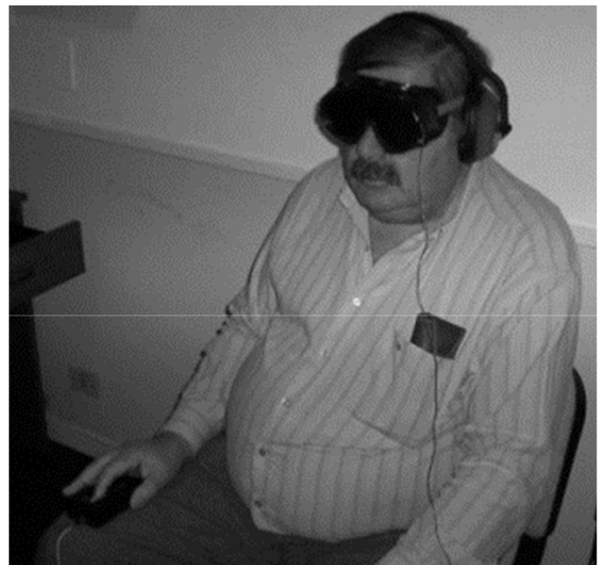
Figure 1. A patient performing the new test.

To perform the TRES test, each patient was sitting in a comfortable chair with dark glasses that did not allow the passage of light (Figure 1). Two LED (light emitting diode) were arranged inside the glasses, flashing during one second every three seconds. The influence of the external noise was reduced by headphones. Volunteers confirmed the view of the luminous