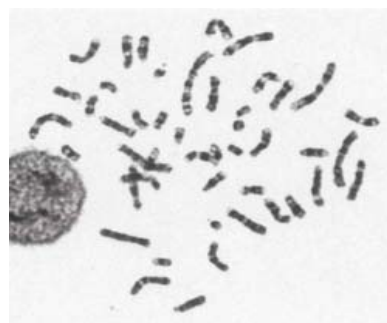
Figure 1. (b) metaphase showing r(22);