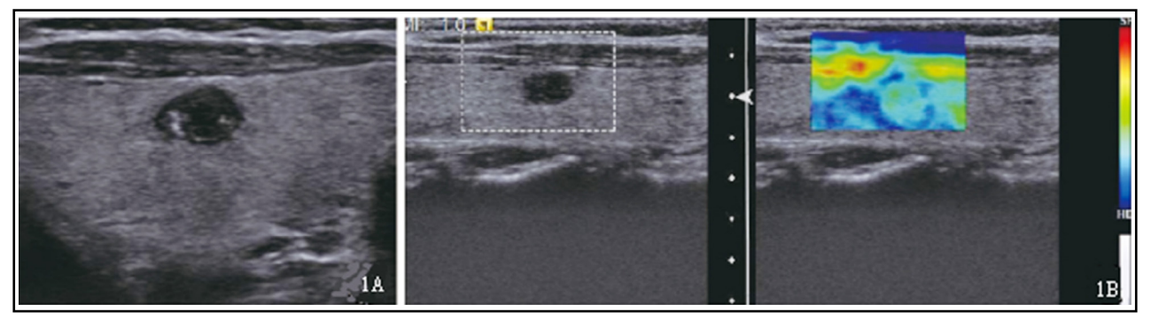
Fig.1: Conventional ultrasound and elastography images of nodular goiter.

Of the 27 malignant nodules confirmed by postoperative pathological diagnosis, 24 were diagnosed as malignant by ultrasound elastography, and the remaining three were diagnosed as benign. Of the 75 benign nodules confirmed by postoperative pathological diagnosis,