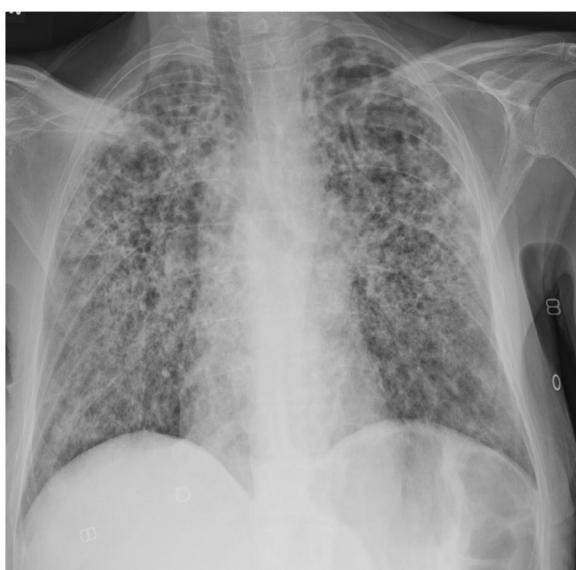
Figure 1 Anteroposterior chest radiograph taken at time of admission. This image shows diffuse bilateral interstitial and airspace opacities.

Laboratory studies showed neutrophilic leukocytosis and low serum potassium, creatinine and albumin levels. The results of an arterial blood gas study on 2L/min of supplemental oxygen were pH 7.38, partial pressure of carbon dioxide in arterial blood 24mmHg, partial pressure of oxygen in arterial blood 71mmHg and bicarbonate 14mmol/L. Urinalysis was unremarkable. Antibody testing for human immunodeficiency virus (HIV) type 1 and HIV type 2 was negative. Serum immunoglobulin (Ig) levels (IgG, IgM and IgA) were within normal limits. The results of serum protein electrophoresis showed no monoclonal proteins, and a connective tissue panel for rheumatologic disease was negative. Chest radiography showed marked, diffuse, bilateral interstitial and alveolar opacities with slight upper-lobe predominance (Figure 1). High-resolution computed tomography (CT) of the chest revealed extensive bilateral interstitial