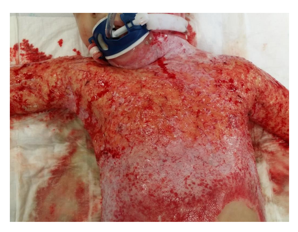
Figure 3. Result of enzymatic debridement.