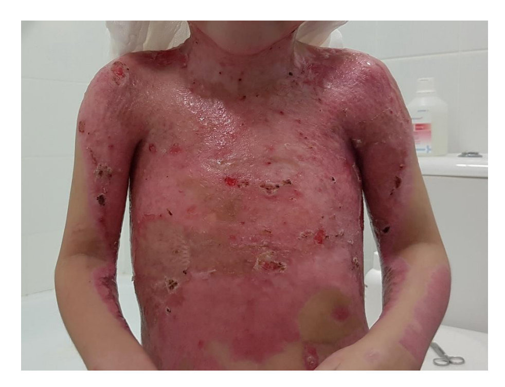
Figure 4. Final result (on discharge from hospital).