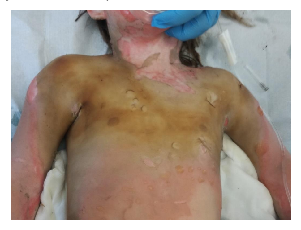
Figure 1. Burn on arrival.

patients with a lack of healing progress or in the event of pseudo-eschar, additional surgical procedures were applied. A total of six of nine children required additional debridement procedures and the covering of some of the wounds with STSG.