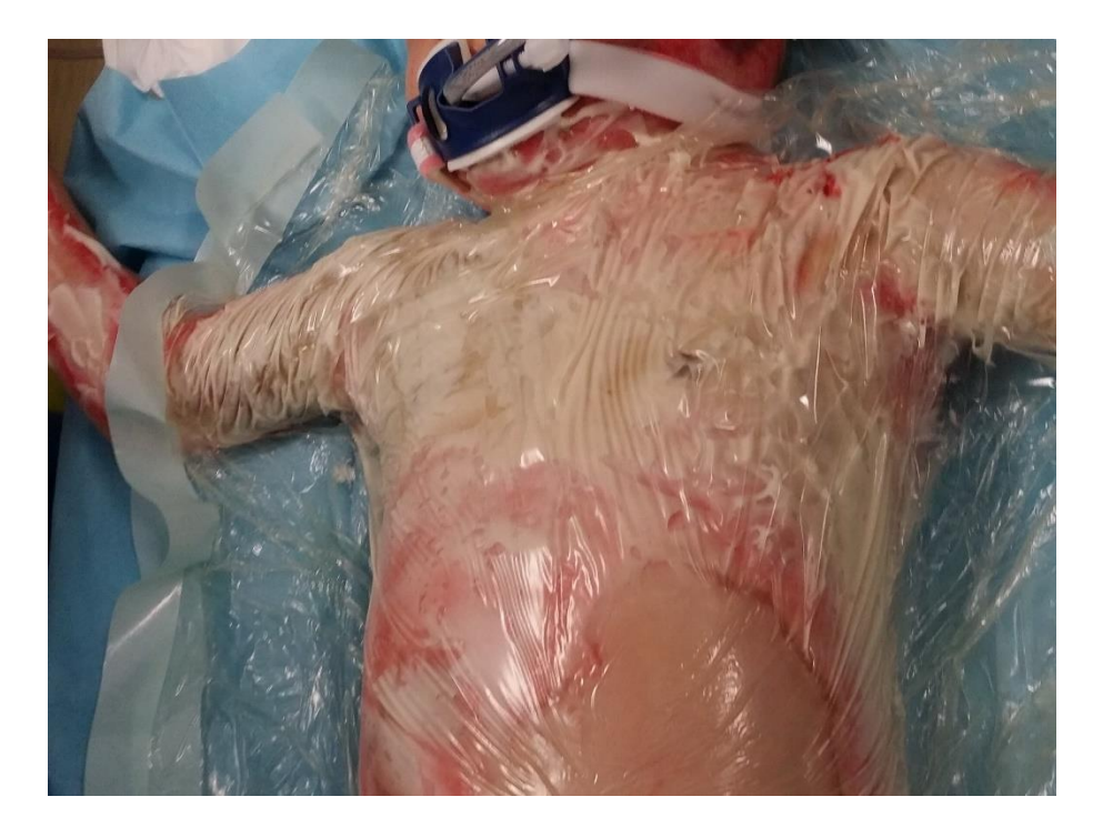
Figure 2. Nexobrid<sup>®</sup> application.