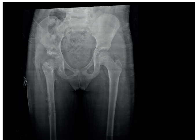
Figure 2. Late postoperative X-ray of the pelvis from the same patient in Figure 1.