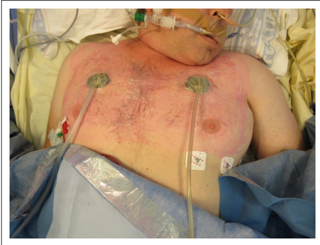
Figure 3. Photograph of VAC system in situ (with permission).

–125 mm Hg; Figure 3). While the subcutaneous emphysema started to improve significantly, a gradual clinical improvement was seen in the first week. VAC therapy was ended 9 days after initiation. The subcutaneous emphysema continued to decrease after removal of the VAC therapy system.