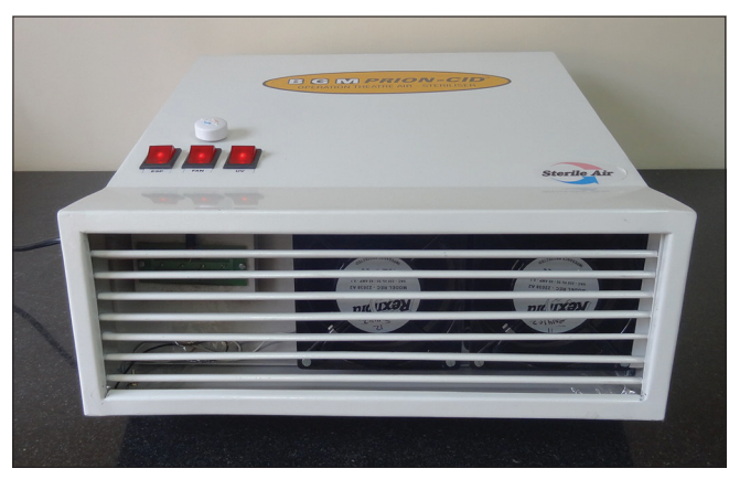
Figure 4: Air sterilizer

Dirt provides culture media for the growth of bacteria and fungi. Therefore, general cleaning of the PFT laboratory is also an important step in infection control. High-quality cleaning removes 90% of microorganisms (hospital hygiene and infection control). Currently, there is little evidence that wipes can control infection.<sup>[28]</sup> Biological waste generated in pulmonary lab should be properly handled and disposed. Health care CDC infection control practices advisory committee and National Institute of Occupational Safety and Health provide a recommendation regarding discarding of waste generated in health care settings.<sup>[29,30]</sup> Separation of infectious and noninfectious waste at the point of generation helps to control infection. Discard solid infectious waste except sharps in Red or Pink container or plastic bag with universal symbol of biological hazards, it signifies infectious waste items. Medical waste requiring storage should be stored in leak-proof containers and should be kept in a well-ventilated area. Air sterilizers may be used to sterilize the air in the PFT laboratory as well [Figure 4].