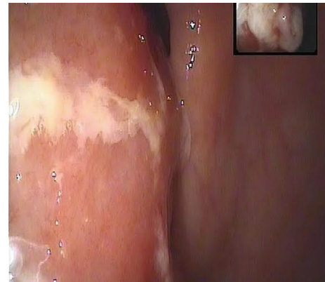
FIGURE 2: Endoscopic picture showing the colonic mass.

Subsequently, staging radiologic studies were performed. Abdominal CT scan with intravenous contrast administration disclosed an enhancing solid mass replacing the entire right colonic area, with corresponding mesenteric blood