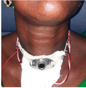
FIGURE 3: Tracheotomy cannula in a patient with recurrent laryngeal papillomatosis.

reported in a patient for whom the tracheotomy could not be performed in time in the event of a recurrence.