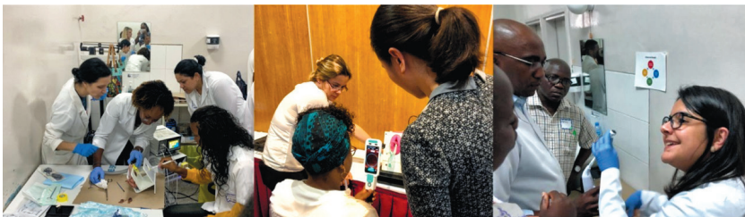
Figure 2. Pre-invasive cervical disease training course stations.