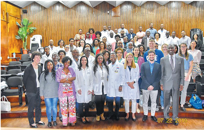
Figure 1. Pre-invasive cervical disease training course participants.

Since 2015, we have delivered 19 courses in seven countries (El Salvador, Mozambique, Trinidad and Tobago, Lesotho, Malawi, Nepal and United States of America). In Mozambique we have held twelve courses.