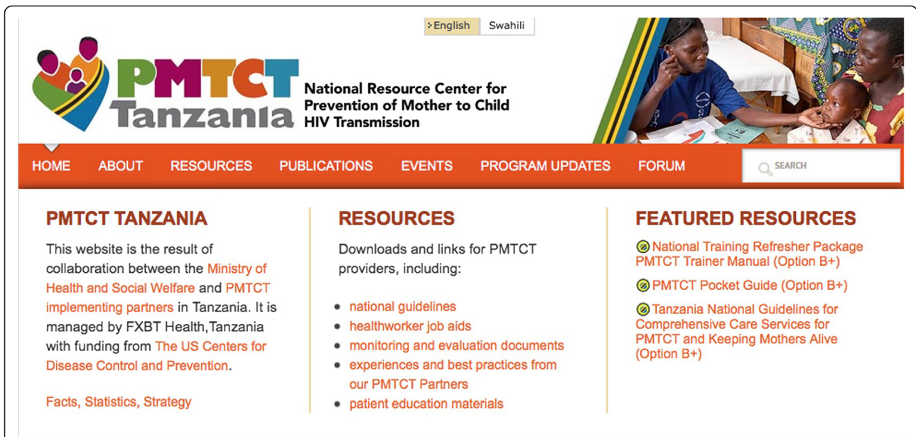
Fig. 1 Tanzania PMTCT website homepage. The Tanzania Prevention of Mother-to-Child Transmission of HIV National Resource Center website home page ( http://pmtct.or.tz/ ) header, illustrating some of the resources available on the website. The image on this figure was purchased with the following Rights Granted defined on the paid invoice: RIGHTS GRANTED: For EDITORIAL (NON-COMMERCIALS) USE ONLY. 100,000 maximum prints or impressions (including collateral and multimedia uses). Unlimited use on one Website permitted. Worldwide distribution permitted

From July 2013 through June 2015, 50 % of website visits originated in Tanzania, with about two-thirds (62 %) from Dar es Salaam, which is mostly an urban area. About one-third (32 %) of Tanzania visits came from unspecified locations, and there were small numbers from Arusha, Mwanza and Zanzibar, which is consistent with limited internet access outside of urban centers. Visits that