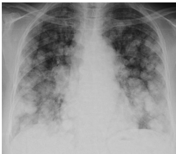
Figure 1. 67-year-old woman with endometrial cancer. Chest radiograph shows innumerable pulmonary nodules with “cannonball” morphology.

literature with special emphasis on radiological imaging.