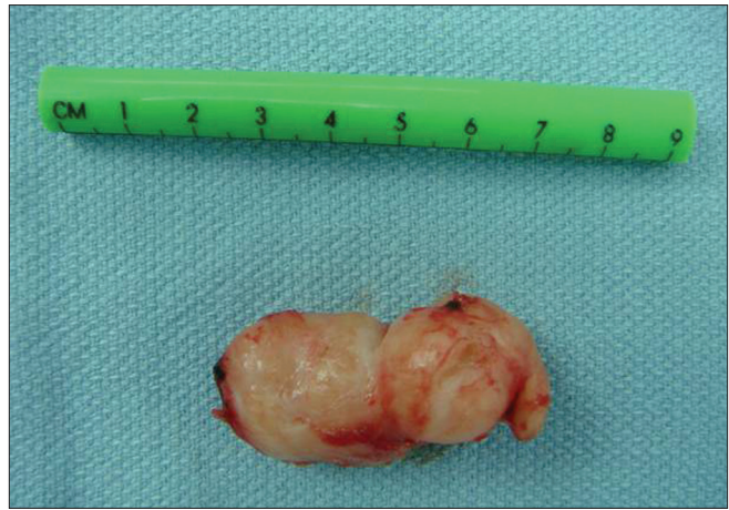
Figure 2: Picture for the leiomyoma after enucleation

To ensure that the underlying mucosa is intact, the right thoracic cavity was instilled with normal saline. Size 14F nasogastric tube was inserted proximal to the area of the myotomy and 50-cc of air injected by the anesthetist gently which did not show any leak. The esophageal muscle fibers were approximated using interrupted 2-0 absorbable suture. Size 24F chest tube was introduced through the anterior 10-mm port and directed towards the apex, the trocars were removed under vision, the intercostal muscle fibers were approximated with 2-0 absorbable suture and the skin closed in subcuticular pattern.